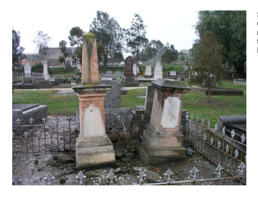
Scholes' family grave at Highton Cemetery, Geelong - the monuments were blown down by the 1926 tornado.