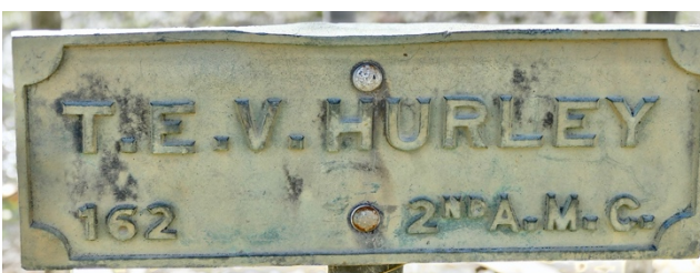
The bronze plaque on Victor's tree today. These were made in 1934 to replace the earlier ones in the 1917 photograph.