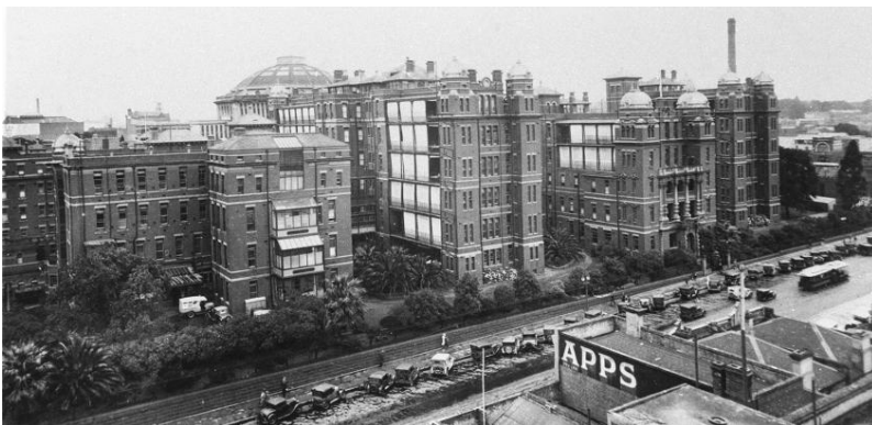
The Royal Melbourne Hospital on Lonsdale Street c1920s.