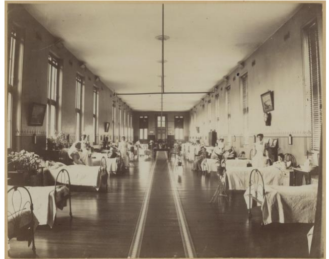
A ward inside the Alfred Hospital, Prahran c1910.