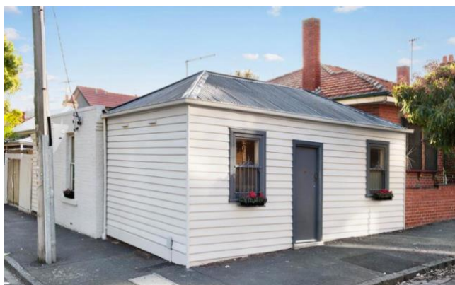
No. 5 George Street Windsor next door to where the Blunden's house no. 9 was once.

Late the following year, 1879, the Blundens moved to Melbourne where the rate books show they were living in a 3-roomed wooden house at 9 George Street Windsor (part of the south eastern suburb of Prahran). Today there are few 19 th century buildings left in that street and numbers 7- 9 have since been rebuilt. However, there is a preserved 19 th century wooden house at no. 5 (built in 1856 and extended in 1879) that gives an idea of what the Blunden's house may have been like. The Stonnington Conservation Review states: 'During the last century, the small timber cottages in George Street (off High Street) were occupied by labourers, building tradesmen, and others serving the needs of more affluent district families.' 1 Frances's mother, and most likely the older girls, probably earned a living as dressmakers for these affluent families.